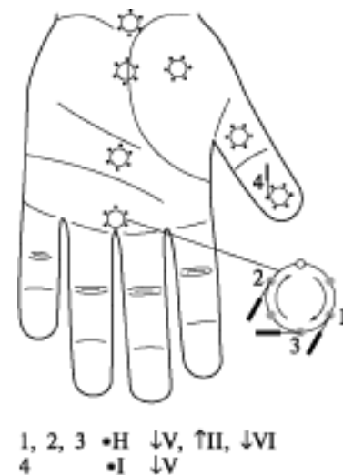
Fig. 2. Sedation of Dryness on the UM-Coldness byol-chakra